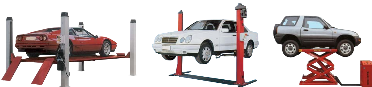
From left to right: - 4-post lift - 2-post lift - scissor lift