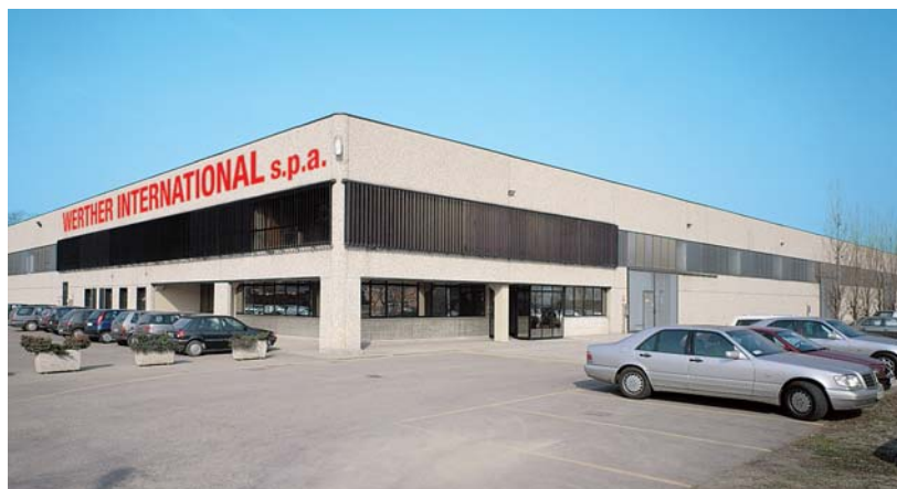
A side view of Werther International headquarters in Cadé, a small town in the countryside of Reggio Emilia, half way between Reggio Emilia and Parma

Due to the important growth in sales, resulting from the success of its products and marketing, Werther International has divided its operations into different divisions and companies, each one responsible for manufacturing a specific line of products.