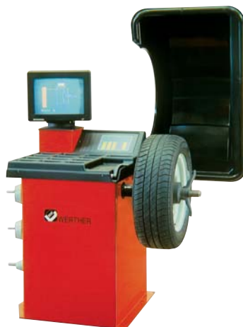
- wheel balancer