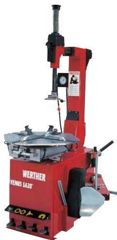
- tyre changer Venus (cars)

Also the well known bead breaker Arpione is covered by various Werther International patents.