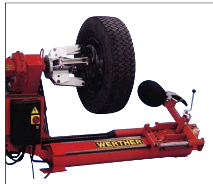
- tyre changer Master (trucks)