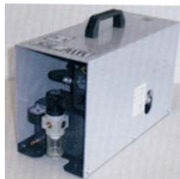
From left to right: - SIL-AIR 15 A - SIL-AIR 50/15 AL - SIL-AIR 100/24

More other are coming from the most various field, such as: laboratories, healthcare, electronics, food, beverage and water treatment, robotics, security systems, textile and much more!